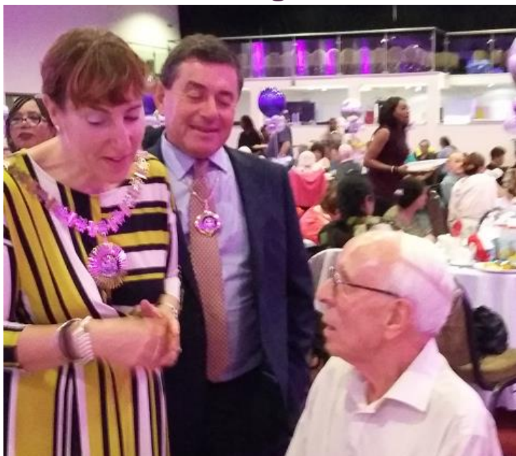
Resident Ambassador with the new Mayor of Barnet and her husband

Every year Jesus house invites us to celebrate life, they provided us with a beautiful banquet and entertainment, we were singing and dancing with our bellies full once again.