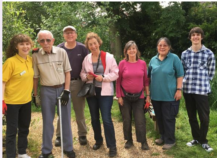
Magnolia court & the friends' of Childs Hill park volunteering

...m to e er ...h teams new sensory garden which will be wheelchair accessible. Thank you to all of our residents and staff that have helped this year and let's keep up the good work.