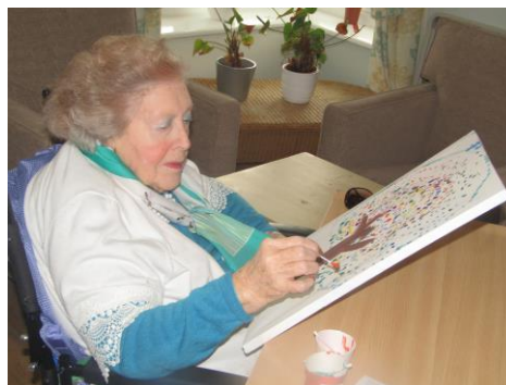
Arts, Crafts and games!