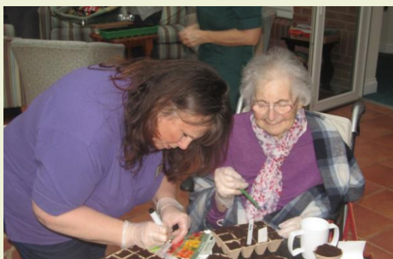
Indoor planting ready for the Spring/Summer

Here are some photos from the last month or two. We have lots of activities going on at our home and it good to take some time to reflect!